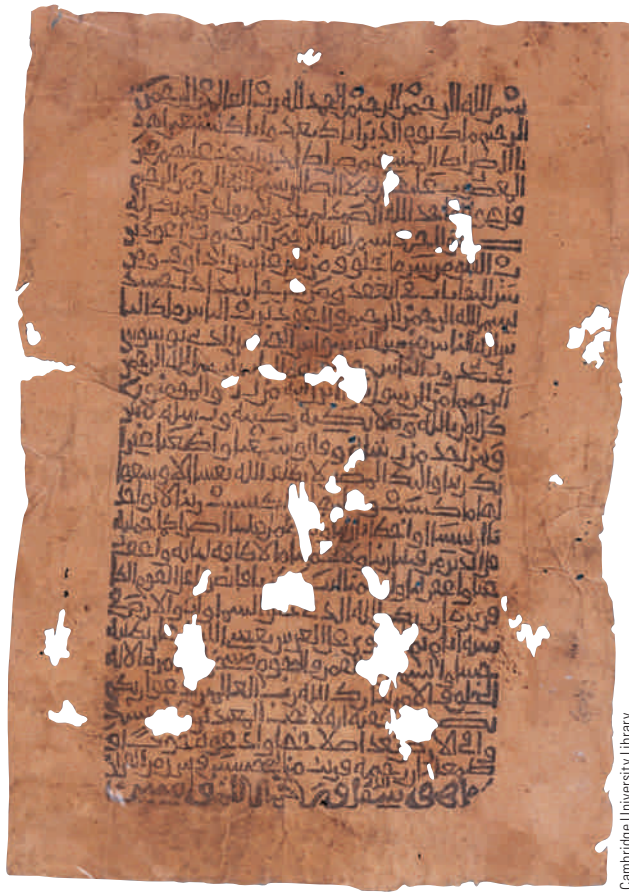
Cambridge University Library

Quran Page Printed from a Woodblock Printing from woodblocks or tin plates existed in Islamic lands between approximately 800 and 1400. Most prints were narrow amulets designed to be rolled and worn around the neck in cylindrical cases. Less valued than handwritten amulets, many prints came from Banu Sasan con men. Why block-printing had so little effect on society in general and eventually disappeared is unknown.